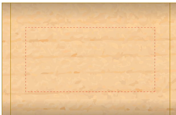
Under side Print size : 60mm x 30mm Pad Print or Laser Engrave