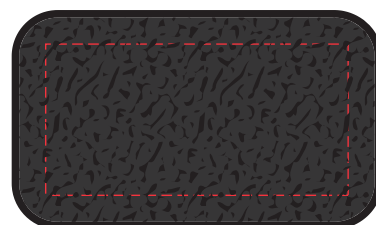
PU Leather size: 46.5 x 26.5 mm