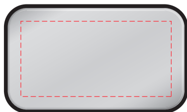
Aluminium Engrave Plate Size: 46.5 x 26.5 mm Laser Engrave, Pad Print, 4CP Direct Digital Print

Please Note: Epoxy Dome with Black Frame Edged Badge