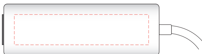
Rear Decoration Size: 57 mm x 13 mm Pad Print