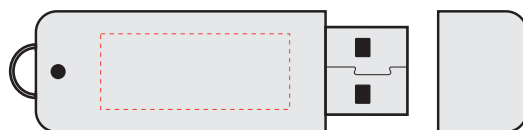
Back Laser Area : 25mm x 10mm Laser Engrave